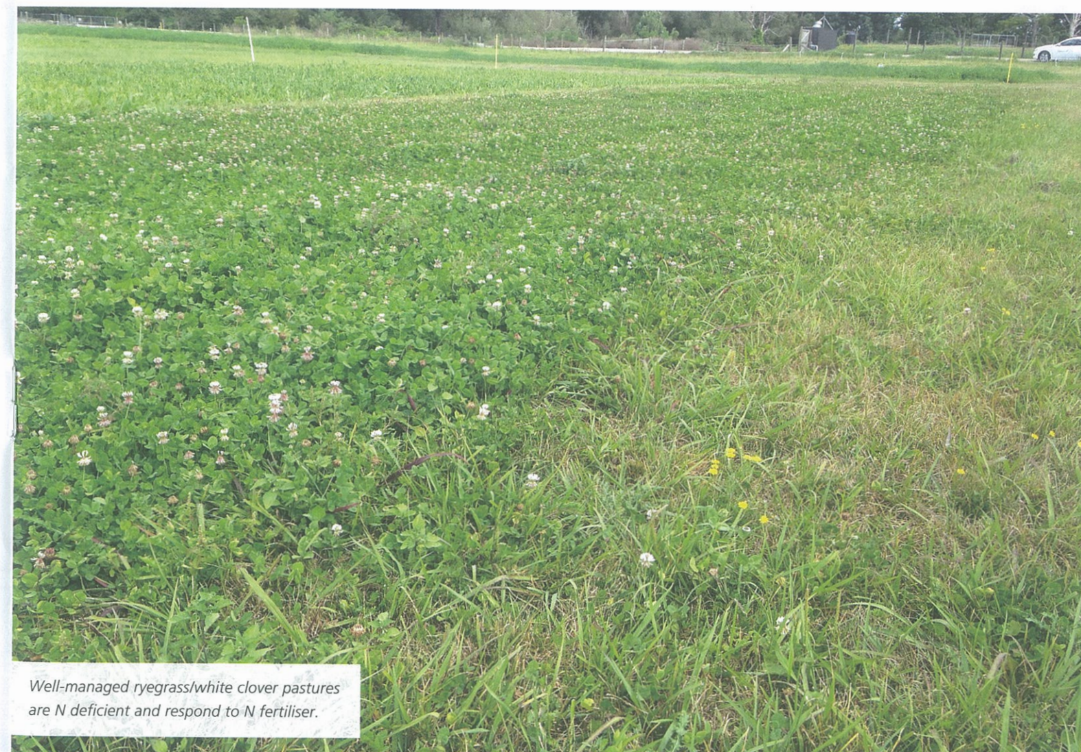
Well-managed ryegrass/white clover pastures are N deficient and respond to N fertiliser.

*(kg/ha, blue line, left hand axis) reported from seven farmlet studies conducted from 1971 to c. 1995 8 , and the associated N use efficiency (NUE, grams N in milk per kg N fertiliser added, red line, right hand axis).