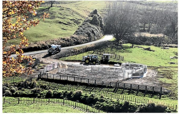
Stockyards under construction for a large beef producer in Waiouru.