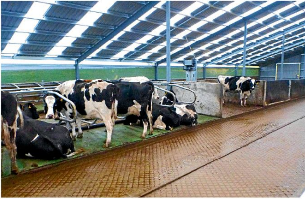
A cowhouse in Southland.