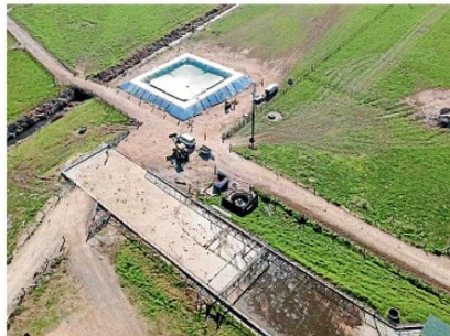
ECOBAG effluent storage system, Whakatane.