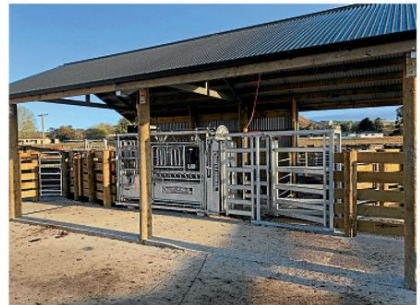
Cattle Handler and auto drafter, Hunterville.