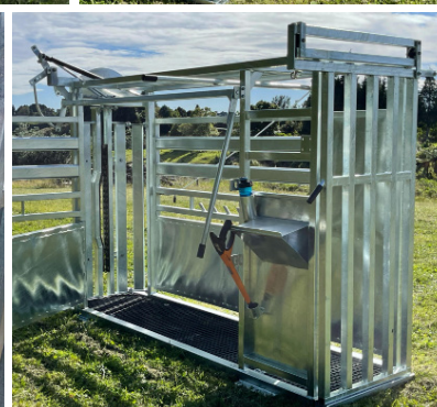
Operation end of the Beefmaster Classic. Monitor, EID wand placement, drink bottle holder, work shelf.