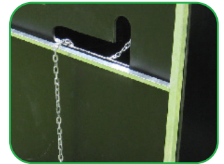
Easy access for backing chain