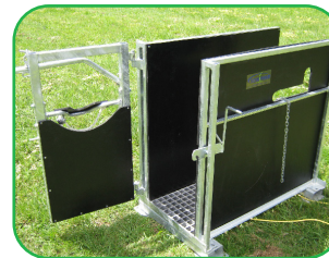
Simple but effective "open" front headbail