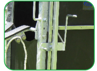
Quick front headbail release