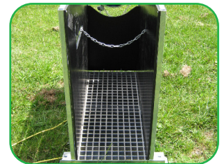
The calf handler can be placed anywhere - easy rear access to race