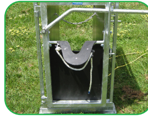
A simple but very effective "headbail" to hold the calf securely for dehorning/ tagging and other jobs